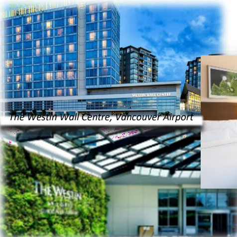
The Westin Wall Centre, Vancouver Airport