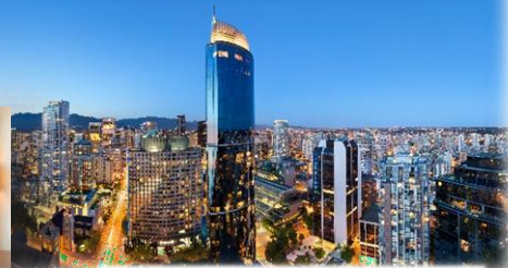
Sheraton Vancouver Wall Centre